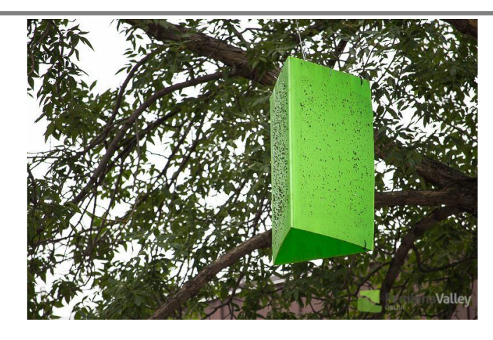
Example of an Emerald Ash Borer Canopy Trap

Our next Advisory Committee meeting will be scheduled for late fall/early winter of 2023, once program staff have completed our fall Spongy Moth egg mass monitoring throughout Bay County.